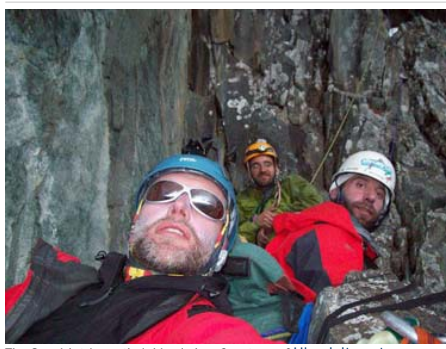
The Spanish trio on their bivy ledge.